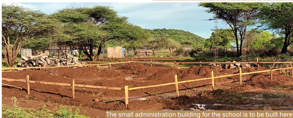
The small administration building for the school is to be built here