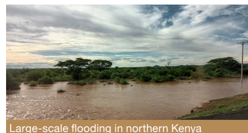
Large-scale flooding in northern Kenya

Another experience we have had are repeated and prolonged power cuts. This, however, confirms that our decision to install photovoltaic systems is the right way forward.