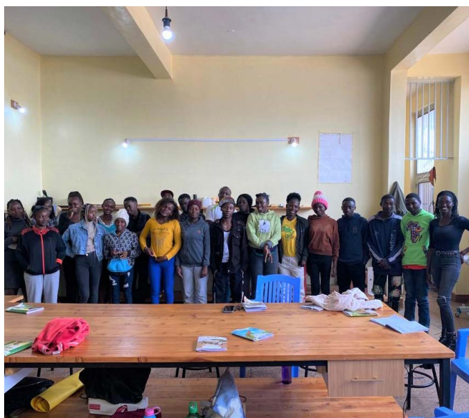
The new trainees in our workshop