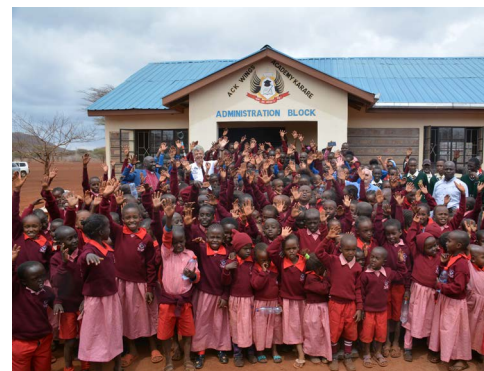
Wings Academy students