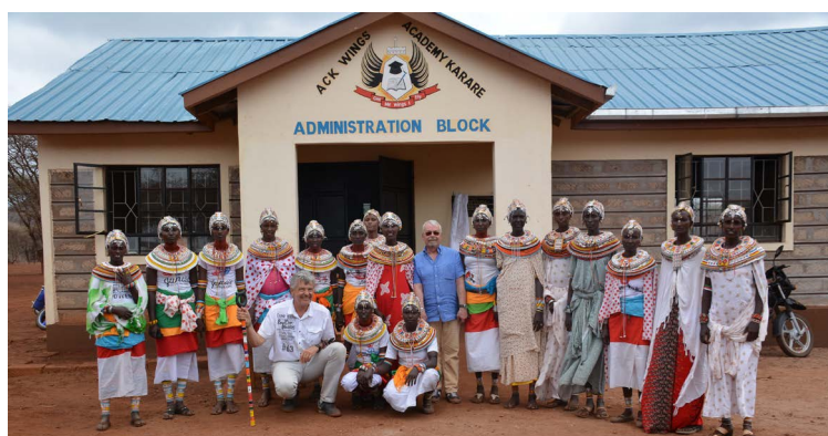
Group picture with women