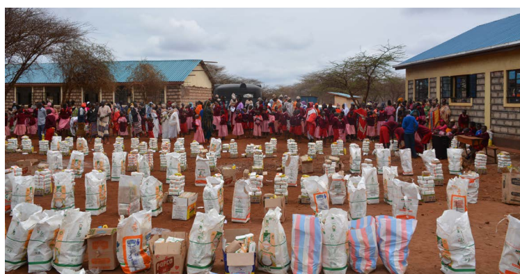
Grocery packages for everyone