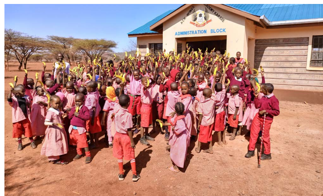
Banana issue in the Wings Academy

https://cargohumancare.de/wings-academy-nicht-mit-leerem-magen-in-den-unterricht