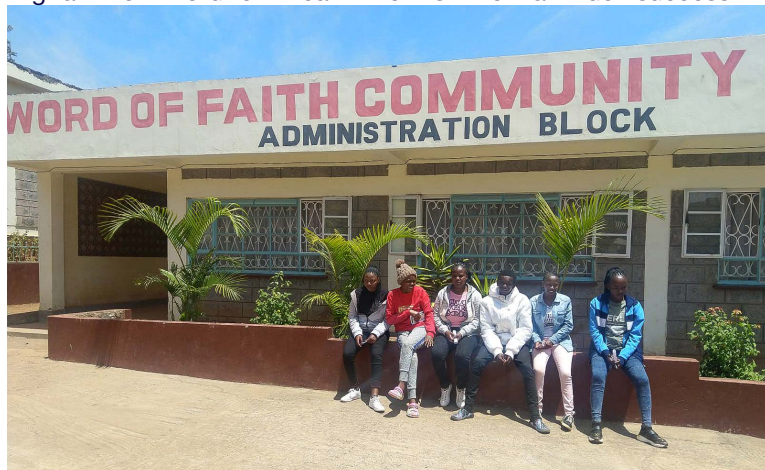
Our students in front of the College

accompanied by the MMH social worker team. We wish them all much success!