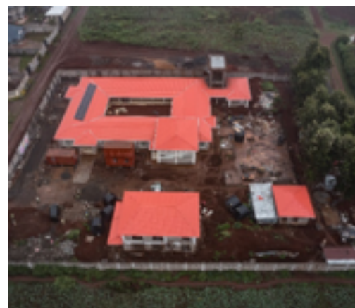
Garden of Siloam