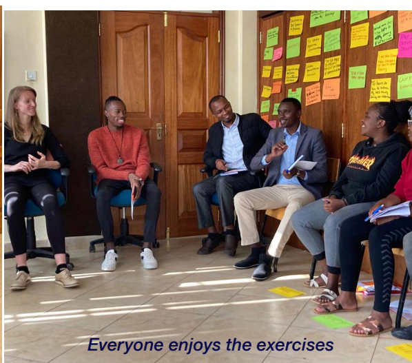
Everyone enjoys the exercises