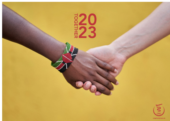
Cover of the CHC Calendar