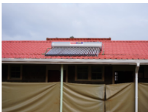
The solar and photovoltaic system

available here: https://www.youtube.com/watch?v=uWYVQuOvyR8