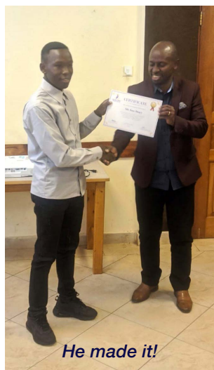
He made it!