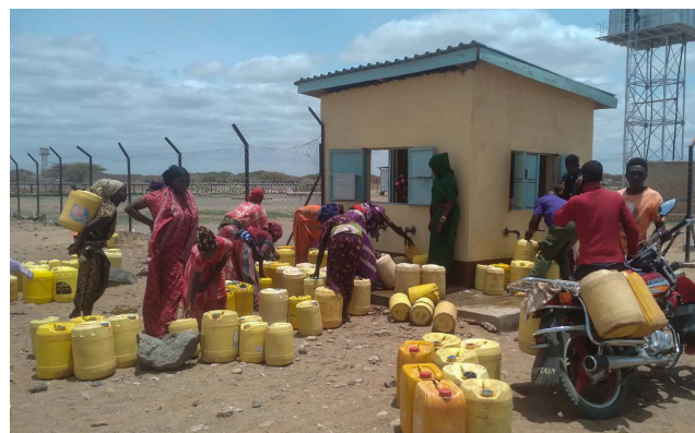
Queuing at the water house

An official inauguration ceremony is expected to take place in early 2022.