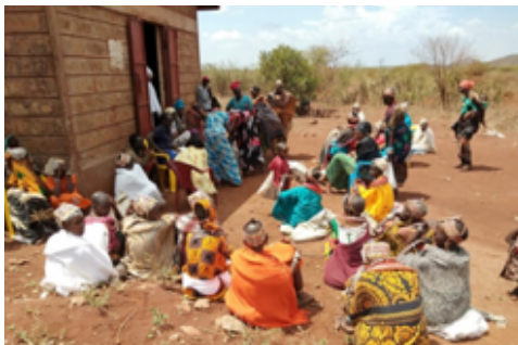
Waiting for the food distribution

the most basic necessities for the months of October, November, and December.