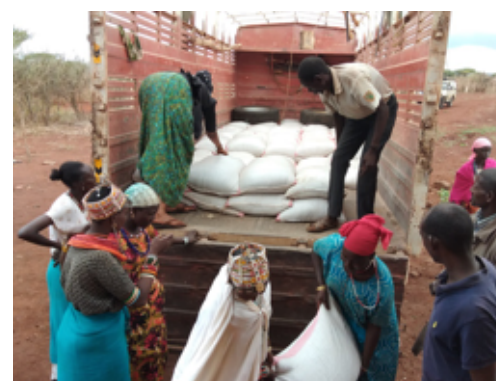
The groceries are unloaded