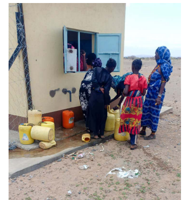
Filling in 20 liter canisters