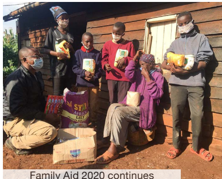
Family Aid 2020 continues