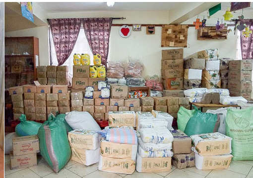
Storage of food in the MMH before distribution