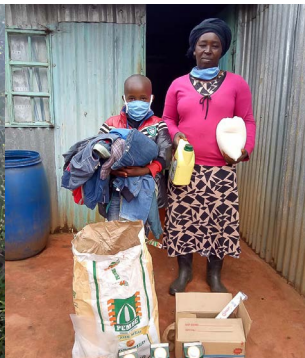
Clothing is also required