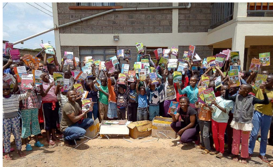
New schoolbooks at MMH