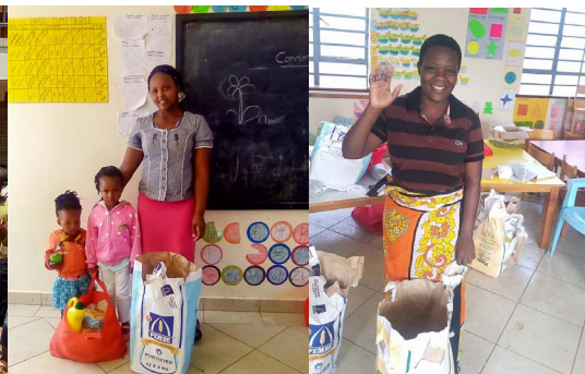
Food distribution at the Happy-Child-School