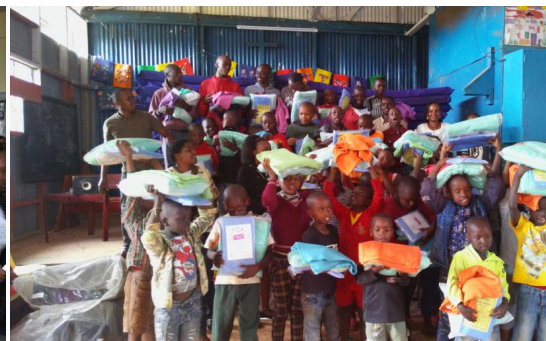
Christmas celebration at MMH