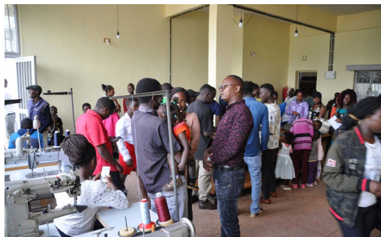
Opening of the new JKR training centre for leather processing