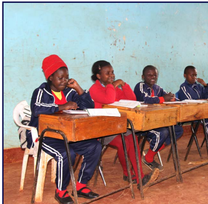
Invest in education: Students of the MMH