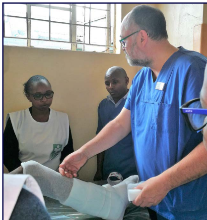
Training within the Medical Centre