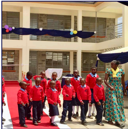
Inauguration of the Happy Child Education Centre